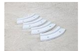
The bushing ring of hopper